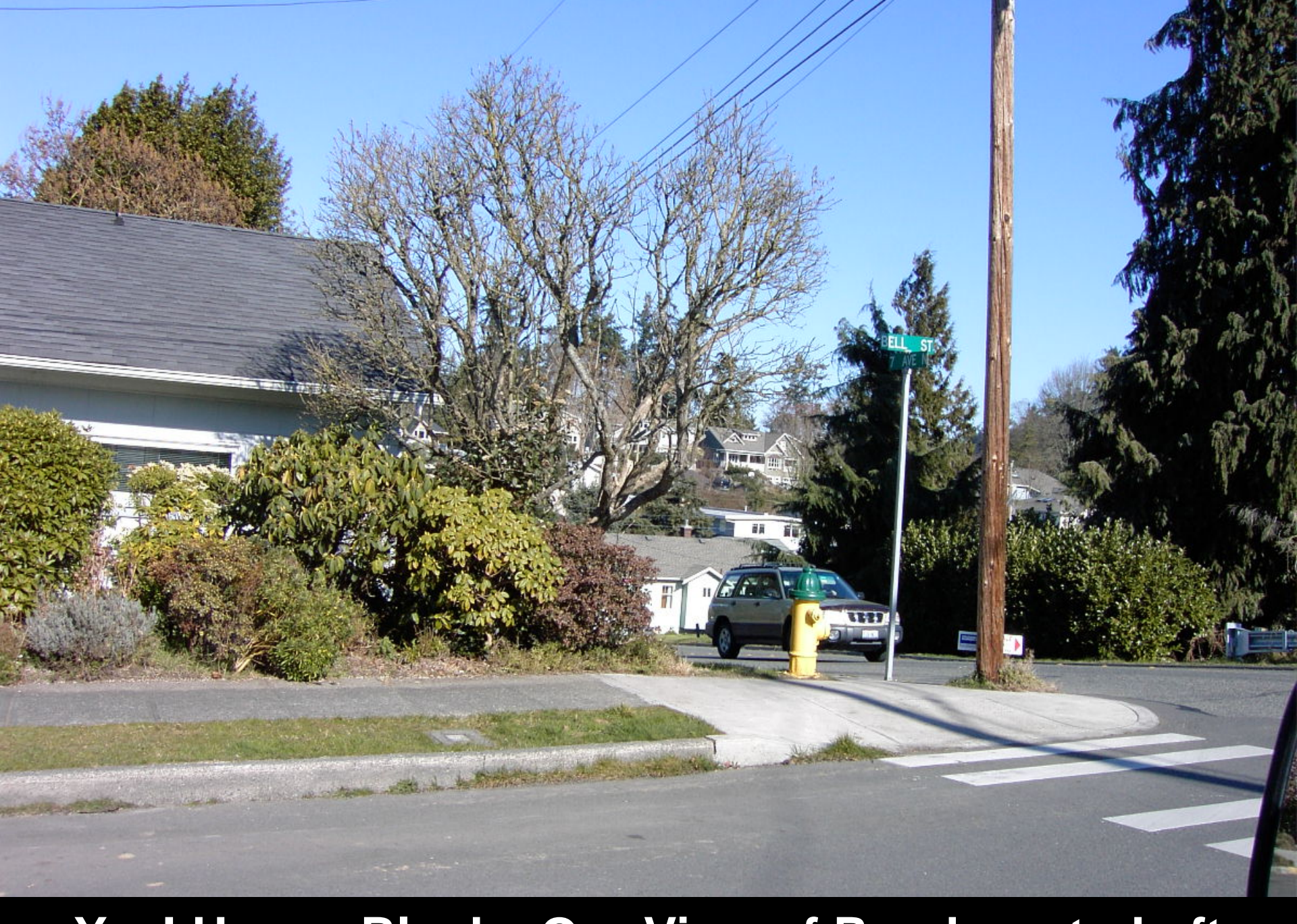
Yes! House Blocks Our View of Roadway to Left