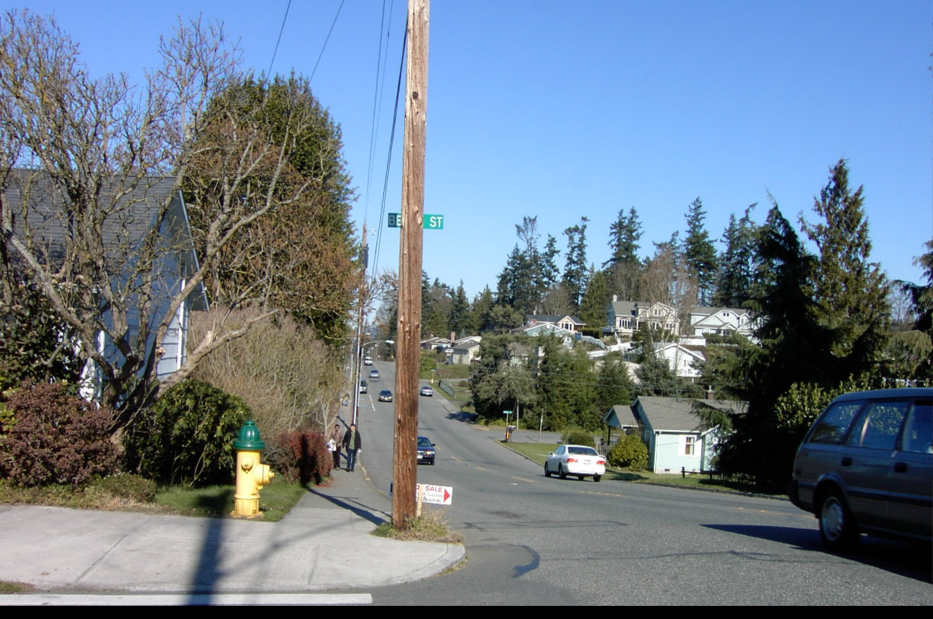
Yes! Bush & Tree Blocked View of Pedestrian and Cars! This is now an open view