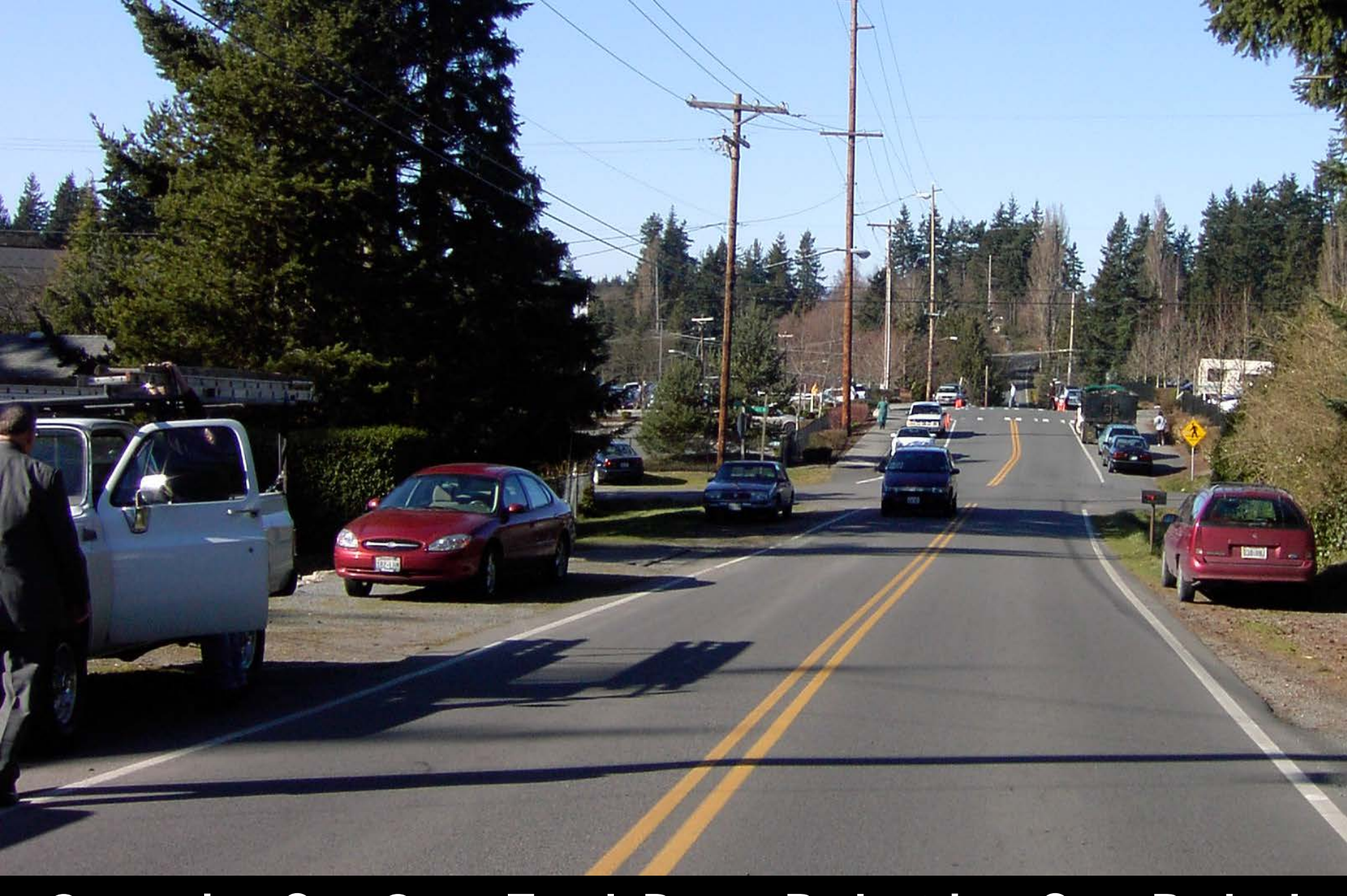
Oncoming Car, Open Truck Door, Pedestrian, Cars Parked on the Shoulder