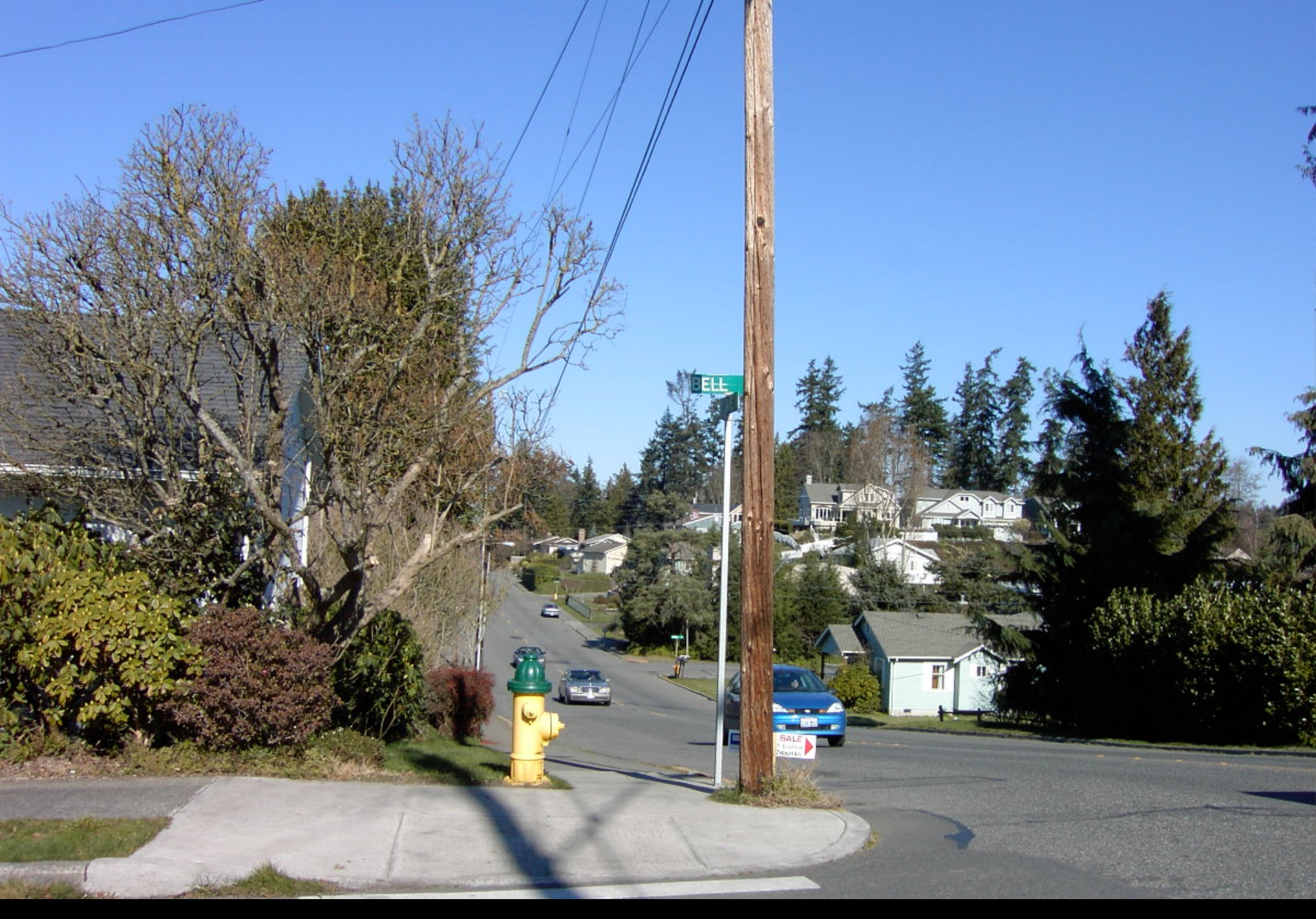
Other LOS Blockages?