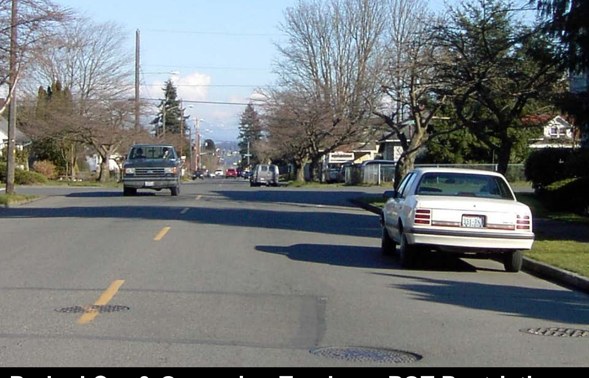
Parked Car & Oncoming Truck are POT Restrictions, Parked Car & Bushes on Right Create an LOS