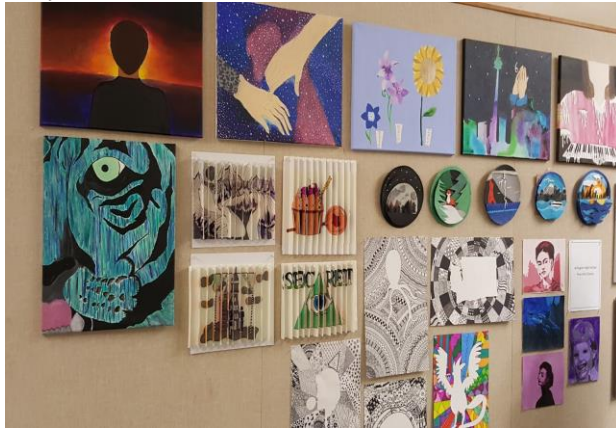
Arlington High School artwork on display at the District Office in January.

January was a great month for our arts, too, as we celebrated visual, culinary, and performing arts by decorating the district office. Our advanced culinary class cooked dinner for school board appreciation and our actors performed numbers from the upcoming musical, "Guys and Dolls."